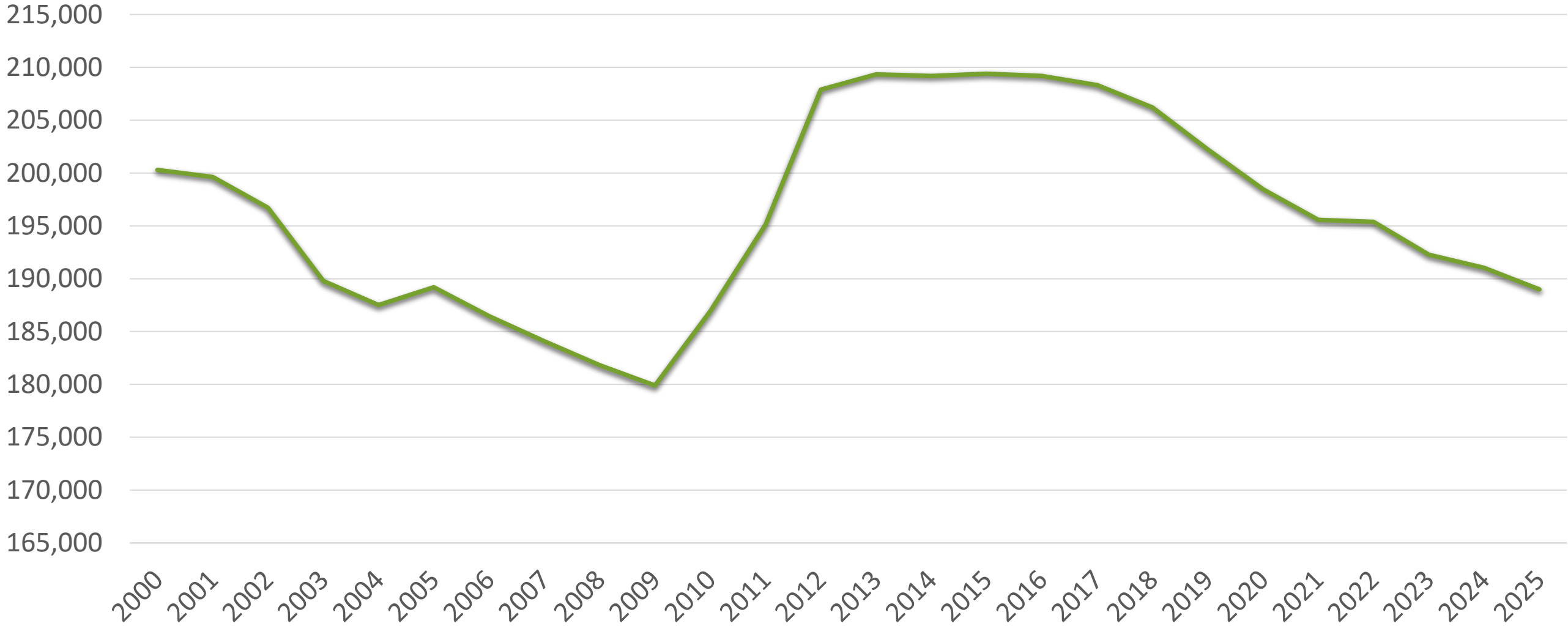
After peaking in 2015, total acreage enrolled in the Agriculture Preserves Program has been on the decline