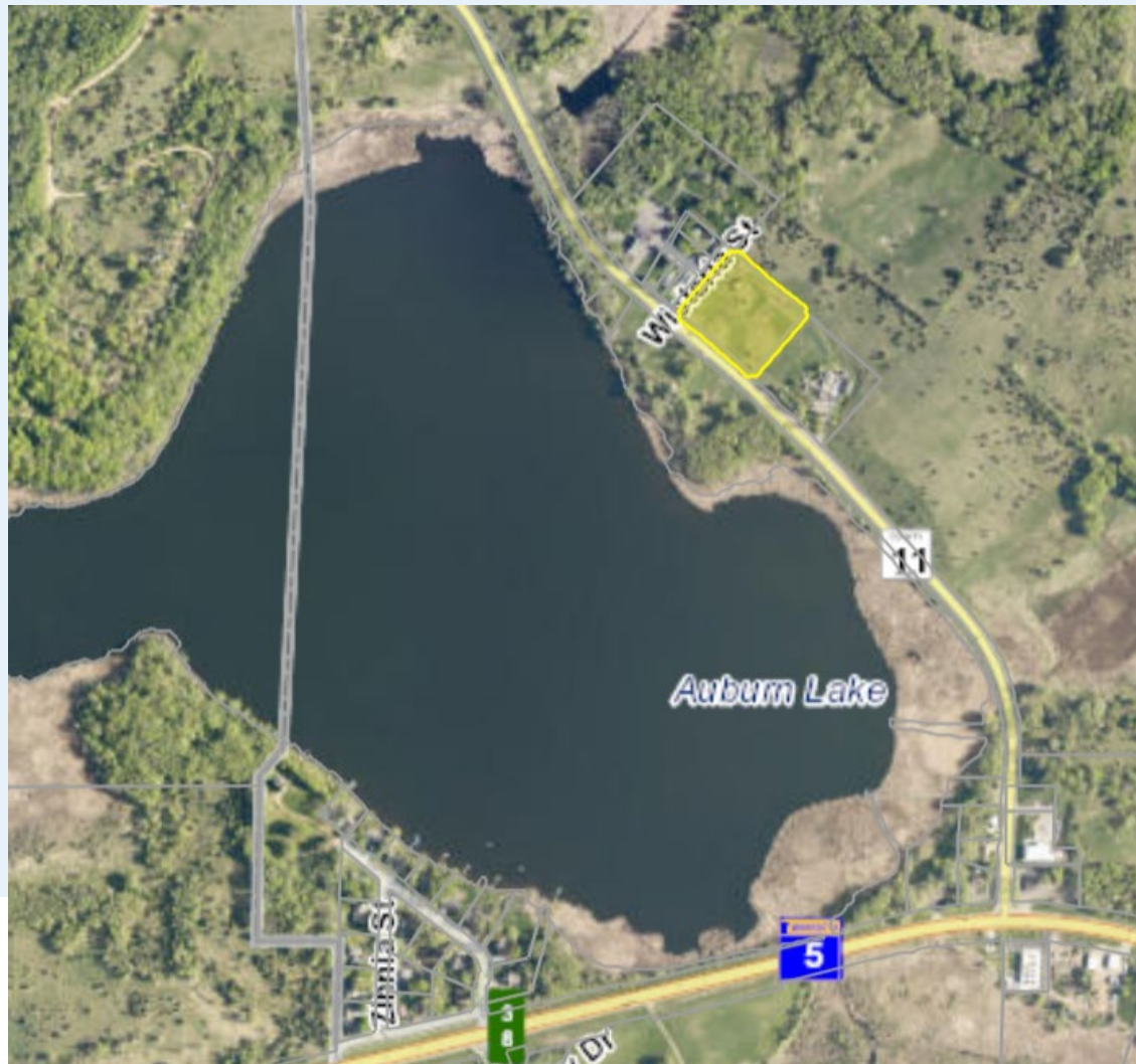
Carver Park Reserve Boundary Adjustment